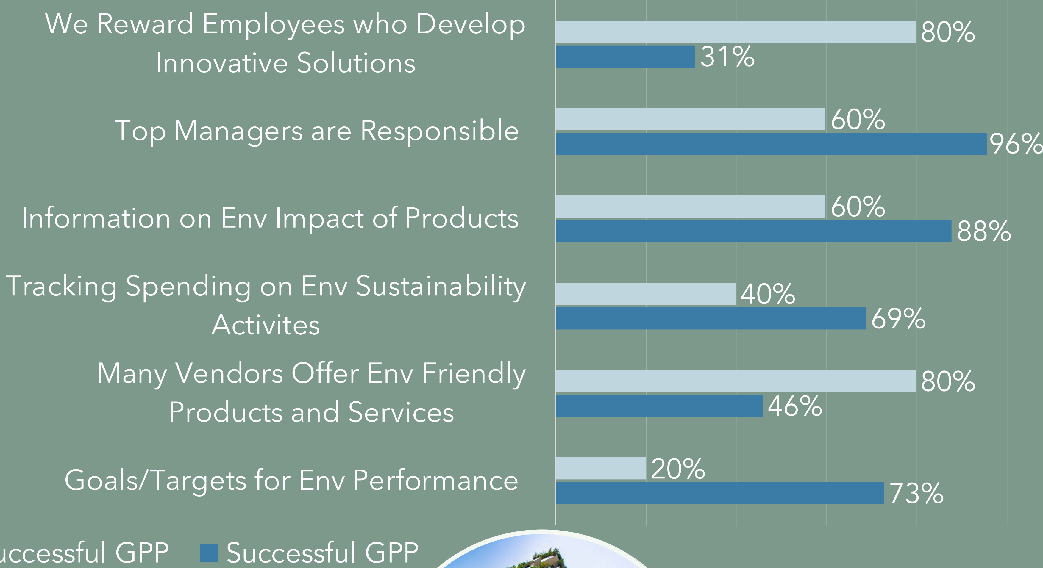
Figure 2: Probability of Successful Implementation of GPP Given Use of Certain Criteria

Innovative solutions and connections to vendors were both associated with corruption and prohibited by anticorruption laws